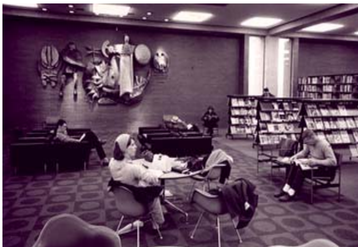
Historic Photo 1969

Thanks to the passage of Measure A, over the next few weeks the Library will receive a long overdue makeover. We will be installing new carpet, blinds, security gate, paint and wallpaper. The Library is also in the process of ordering new furniture. The work will take place during closed hours and should not impact library hours or services.