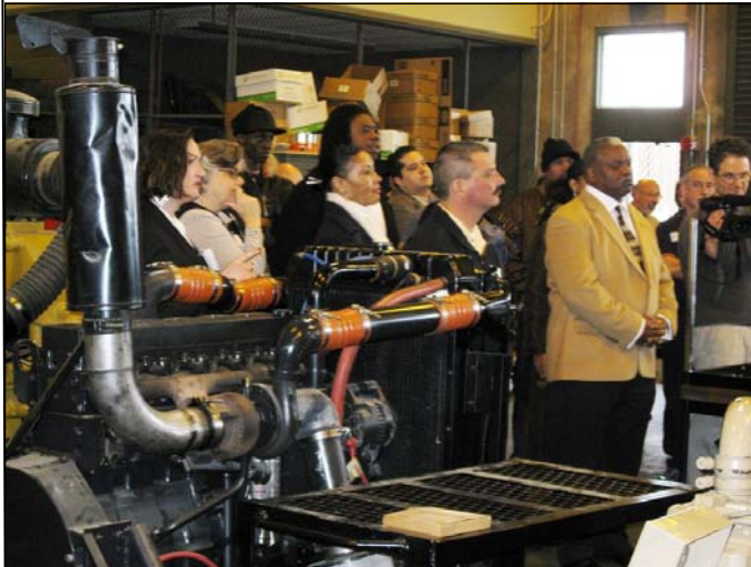
Visitors tour the Diesel building