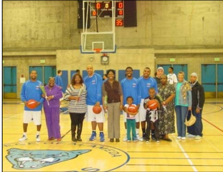
Sophomore honorees and their families

COA came close to winning its last home basketball game of the season on Feb. 17, but in the end the team lost a hard-fought game to rival Merritt College. The evening honored sophomore players, who were brought onto the court with members of their families to be congratulated for a year of hard work.