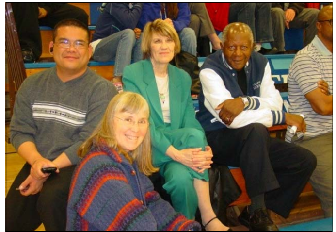
Faculty and administrators cheer on the team